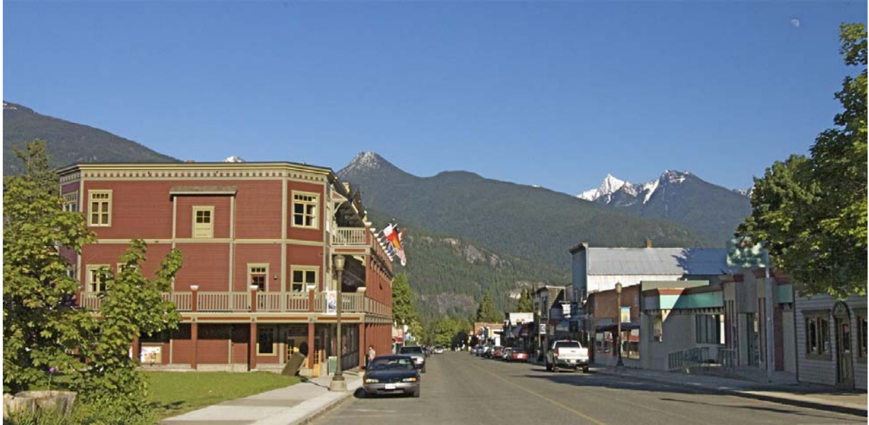
Kaslo Hotel, Front Street and Mt. Loki