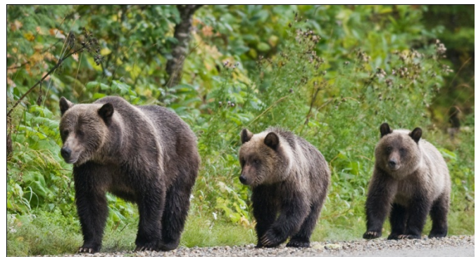
A Grizzly Family