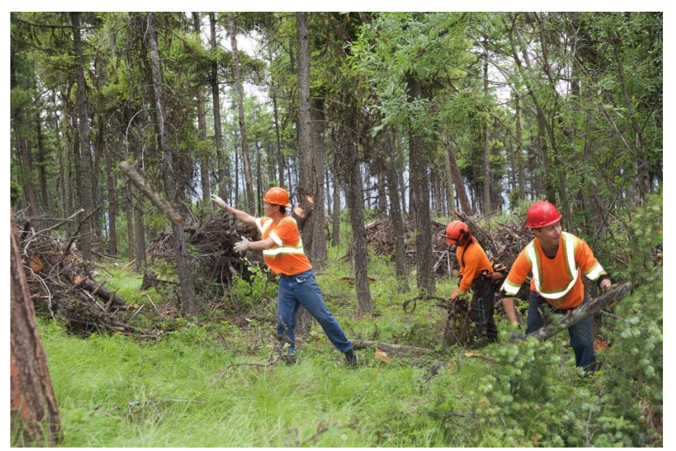
Fuel treatment in the Westbank First Nation Community Forest.

The authors report that only 10% of the hectares identified as moderate to high-risk have been treated. The estimated cost of treating all remaining areas is $6.7 billion. A core question the Government of British Columbia faces concerning community safety then is, "How can wildland urban interface areas be treated more quickly and at lower cost on a per hectare basis?" The report states that the expansion of the community forest program is among the components of new more successful approach.