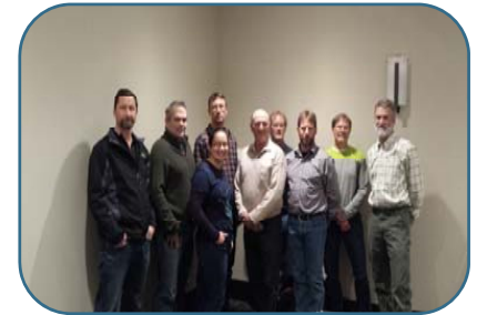
Operations and Governance