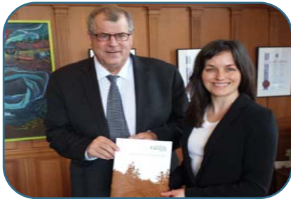
External Relations and Government Policy