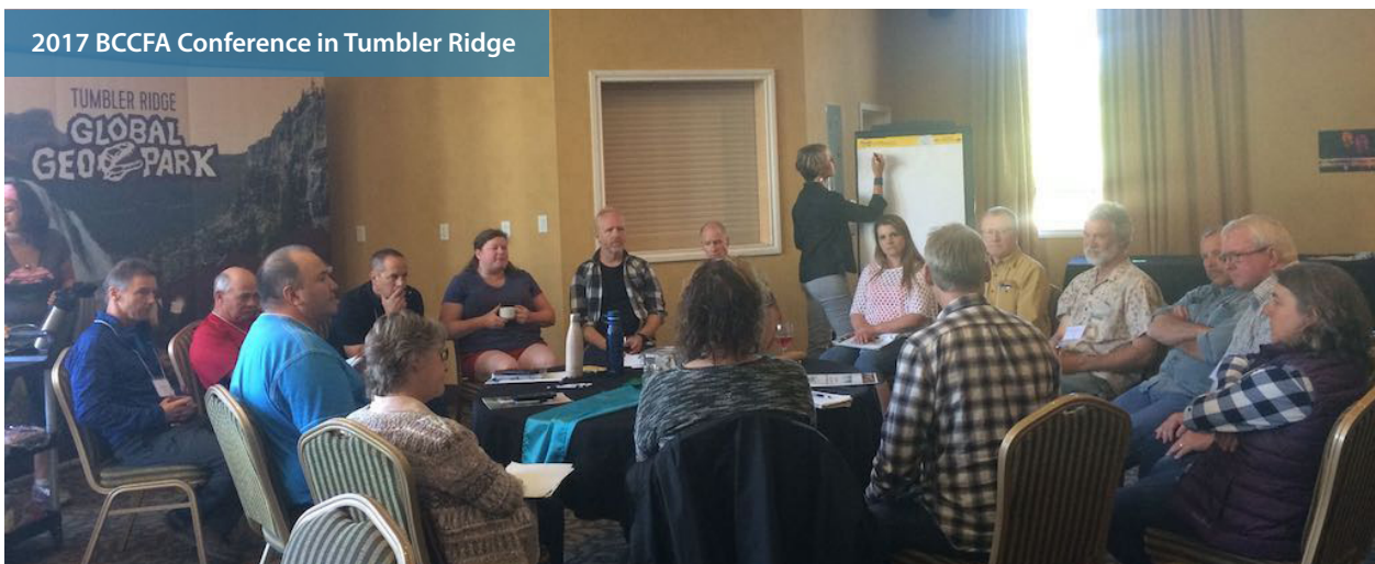
2017 BCCFA Conference in Tumbler Ridge