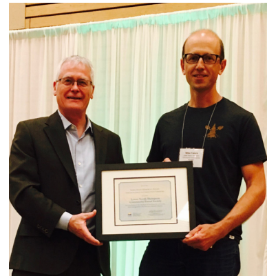
LNTCSociety receiving the 2018 Robin Hood Award for Excellence in Community Forestry

The annual Conference organized by the BCCFA has grown into an important platform for exposing the achievements of community forests and allows managers to connect with policy-makers, researchers and forest professionals from different fields, share insights and receive new inspirations.