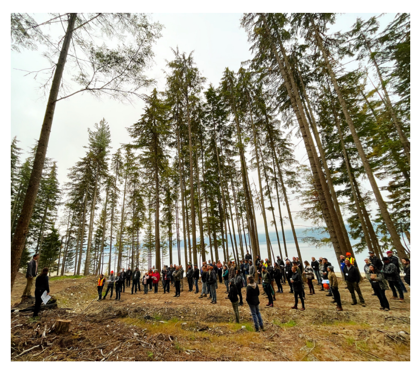
Field tour of NACFOR's operating area (pictured above and adjacent). Dan Wiebe of Box Lake Lumber (upper right).

Throughout Wednesday morning we were treated to a field trip to NACFOR's operating area, which included stops at one of their fuel treatment areas, Box Lake Lumber, and a beautiful lakeside lunch hike.