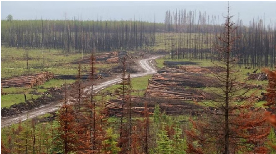
Salvage logging post-wildfire in Cheslatta Community Forest

Based on this assessment, there are a number of key types of situations or scenarios that may exist discussed below.