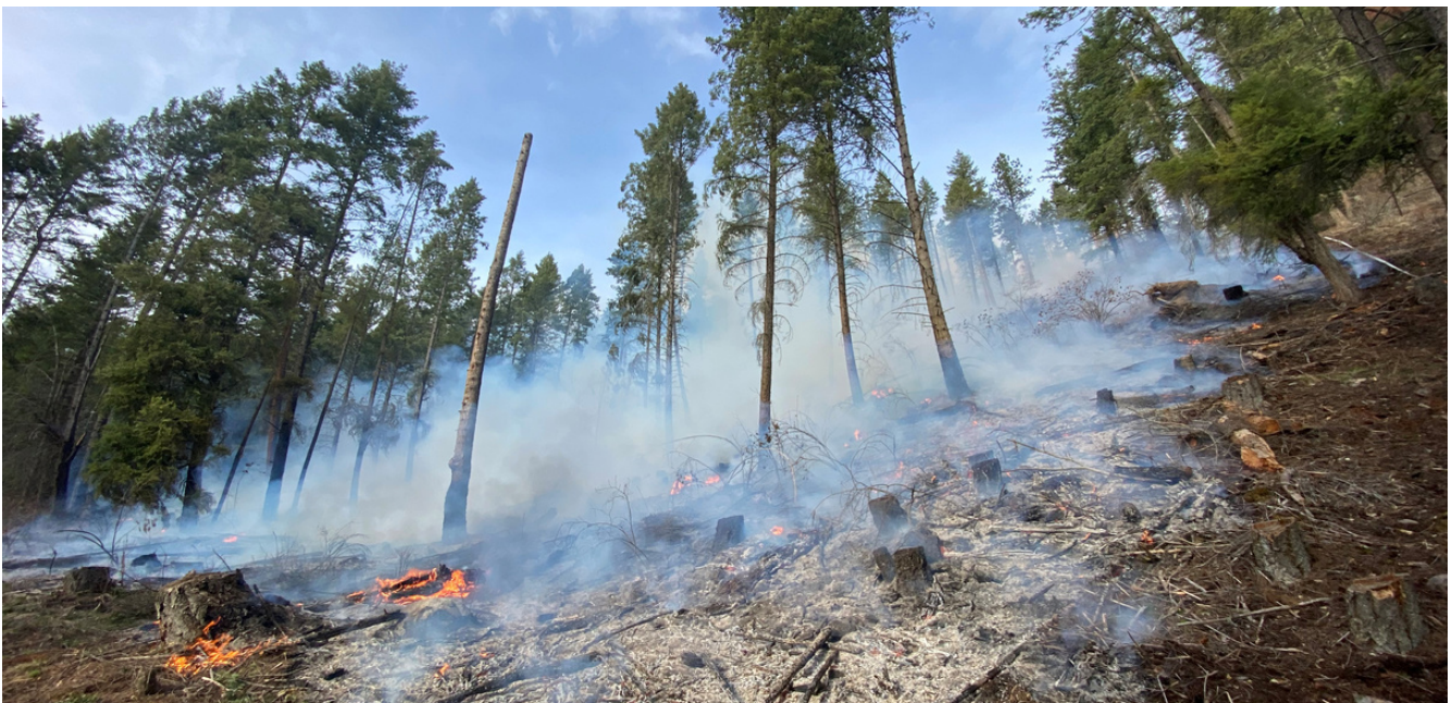
Prescribed fire treatment conducted at Creston Community Forest

The BC Wildfire Service has developed several resources on their Tools for Fuel Management website that can provide guidance to community forest seeking to reduce wildfire risk within and adjacent to their tenure. The website provides guidance documents and templates on developing fuel management prescriptions and WUI Wildfire Risk Reduction Plans. It also has Key Contacts for each fire centre that should be consulted with developing WRR project.