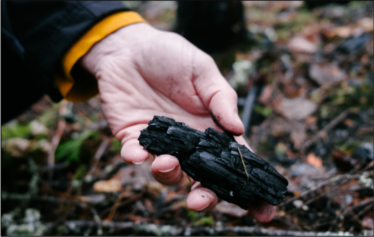
Cover Photo: After the Harrop Creek Fire Below: Post-treatment field tour