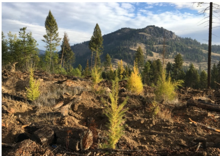
West Boundary Community Forest rehabilitation post 2015 wildfire.

Forest-related rehabilitation is the other key aspect post wildfire and differs from the rehabilitation of fire suppression activities described above (e.g., fire guards and roads). Forest related rehabilitation involves activities such as the removal of fire impacted trees with harvesting equipment and planting a new cohort of trees to regenerate the site. The approach to be taken for forest stand rehabilitation will differ