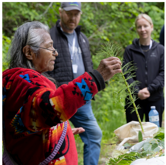
Demonstration of cultural and medicinal plants