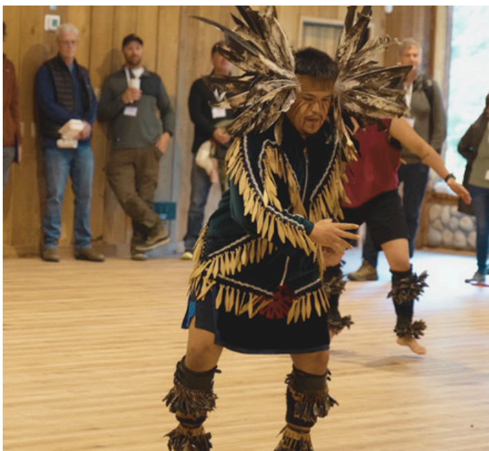
Traditional song and dance to welcome delegates