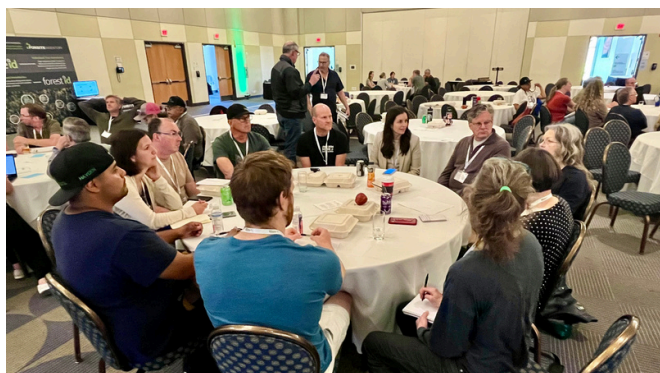
Delegates in regional groups for fuel treatment discussions.

Each gathering inspires us and reinforces the courageous work being done by community forests throughout the province.