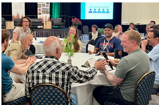
Lots of laughs...!