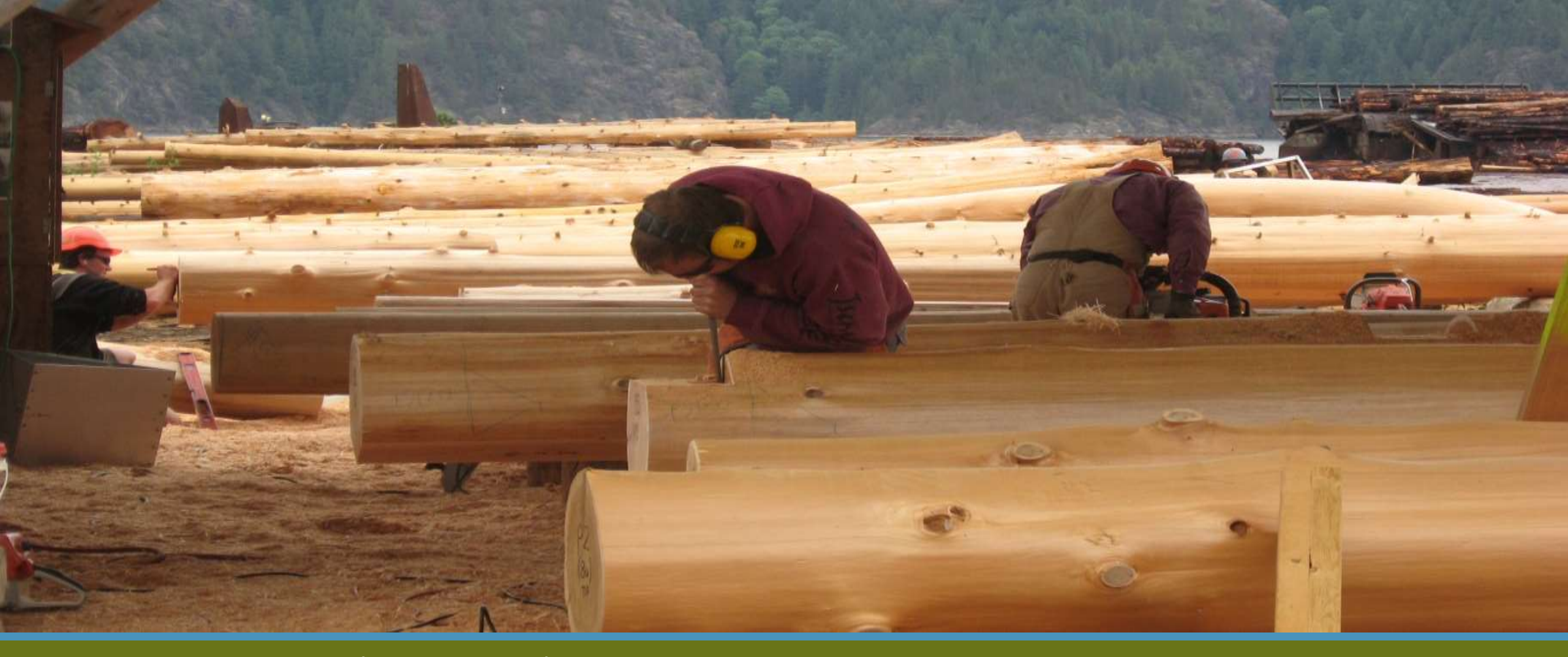
Cut Control & Log Sales