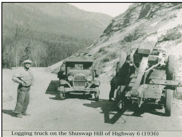
Logging truck on the Shuswap Hill of Highway 6 (1936)