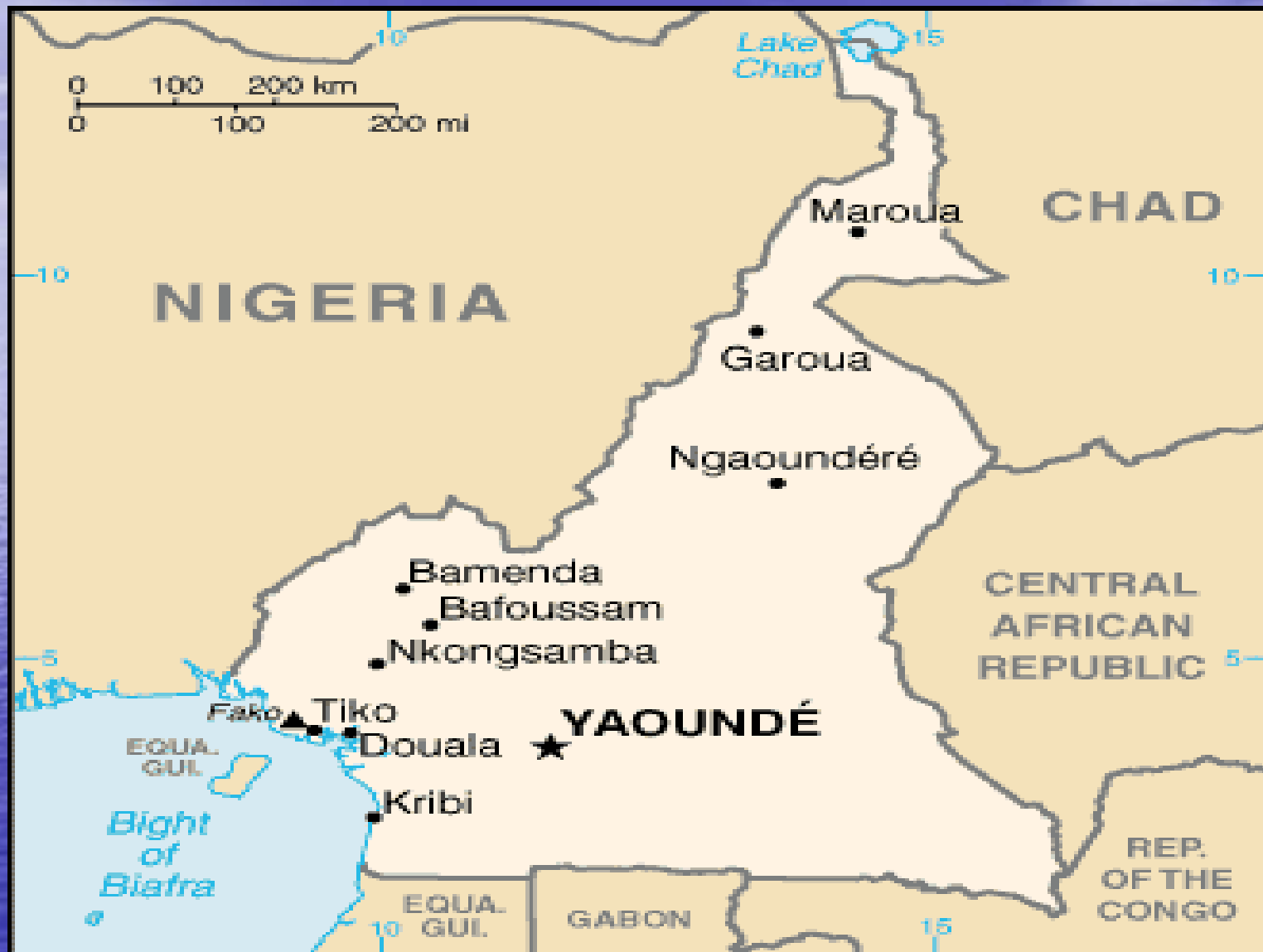
MAP OF CAMEROON