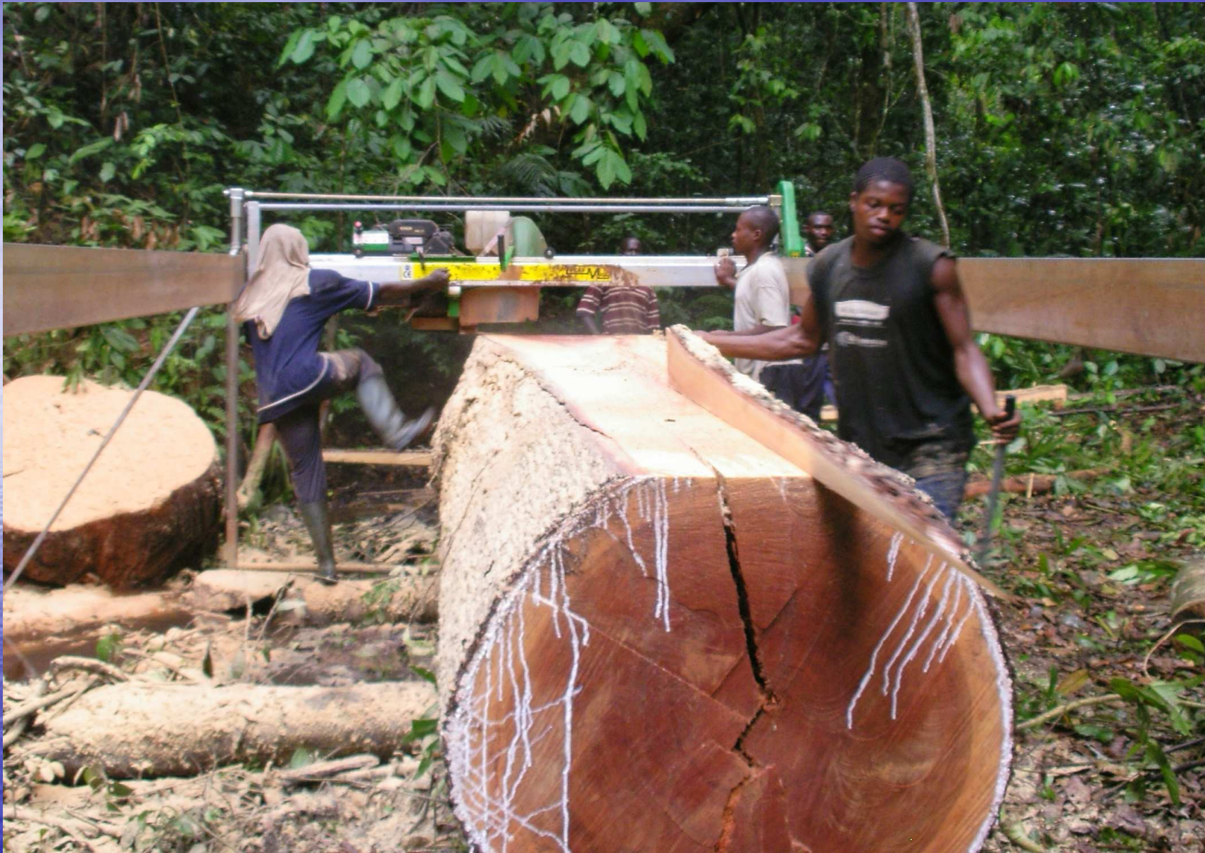
Picture depict wood processing that is characterized with lack of appropriate equipment and poor working conditions