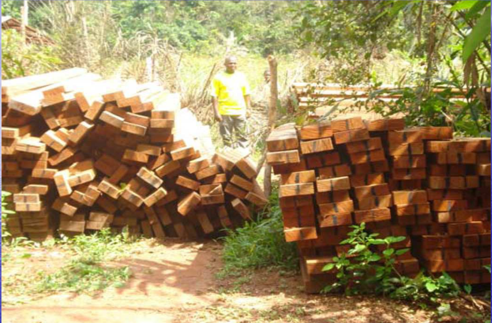
Undelivered timber: Sawn and extracted at great expence but not picked-up