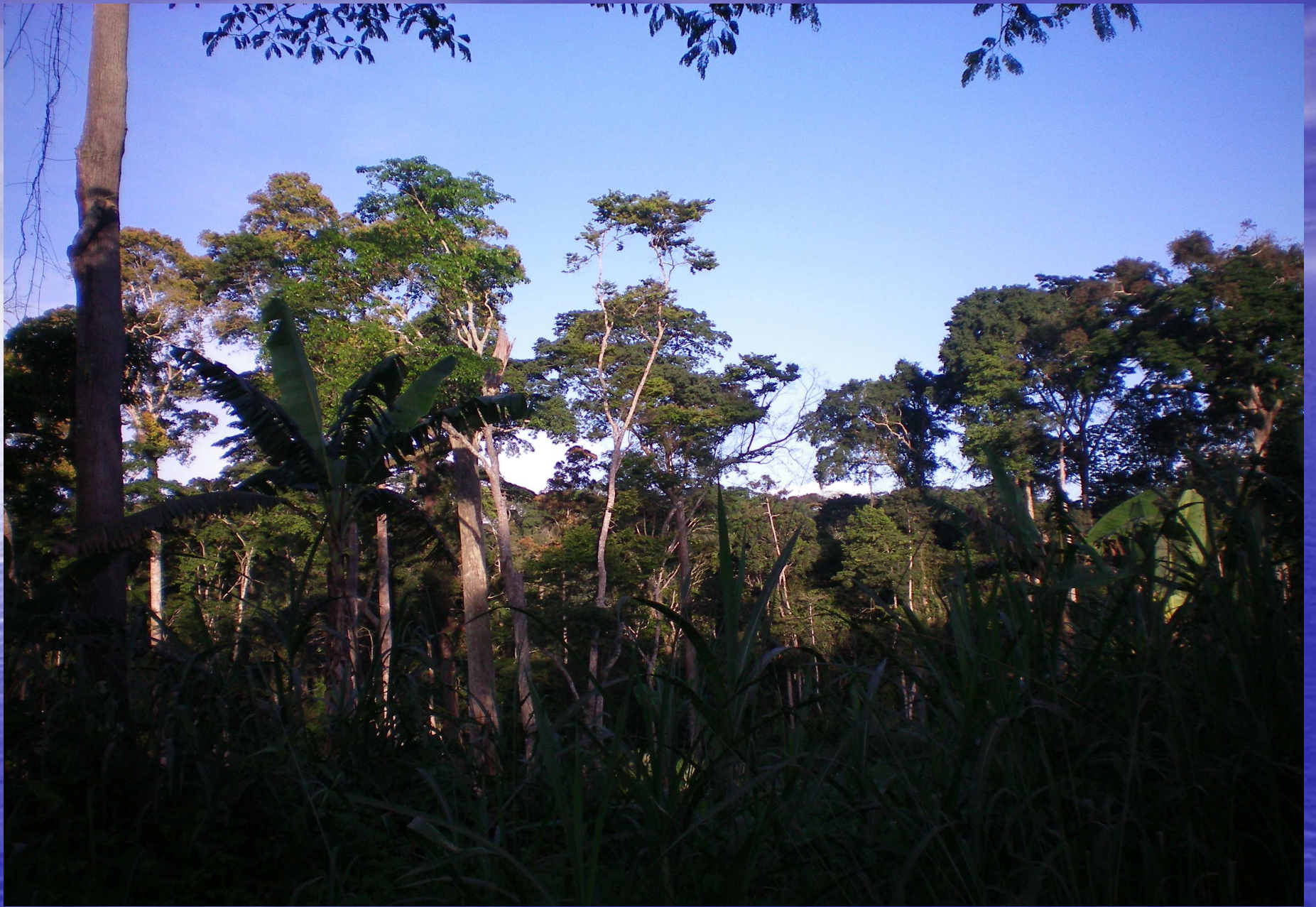
Example of Cameroon's Tropical Rain Forest