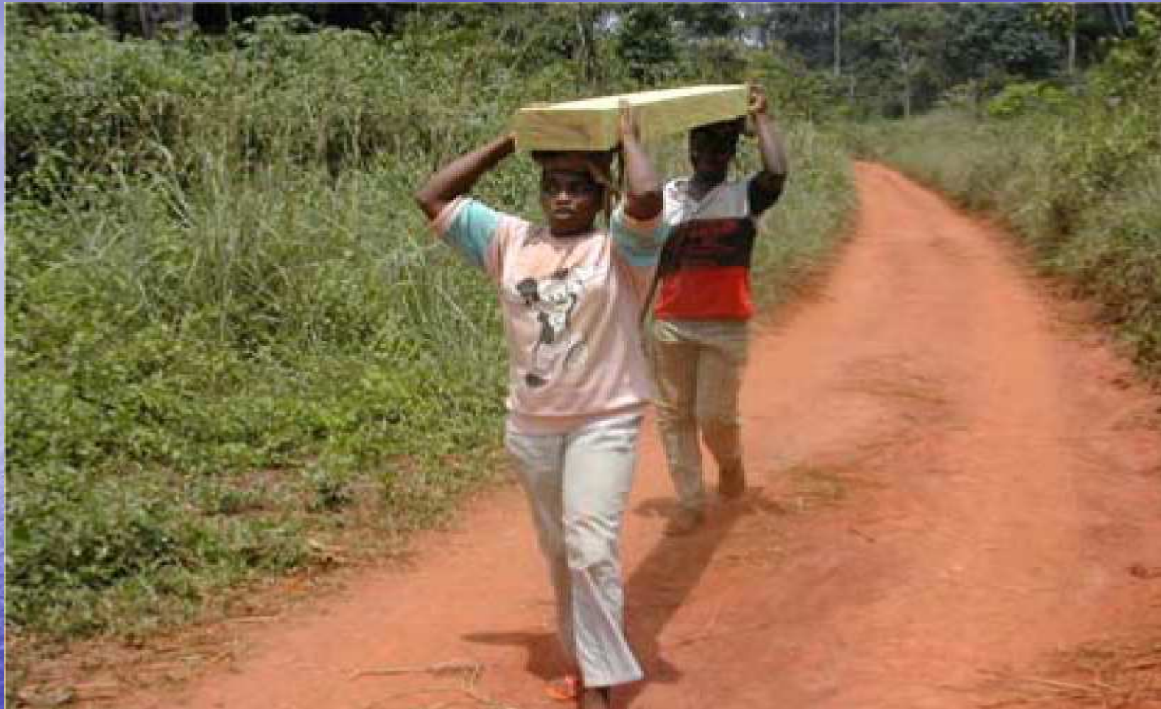
Head-loading of sawn timber from a community forest in Cameroon