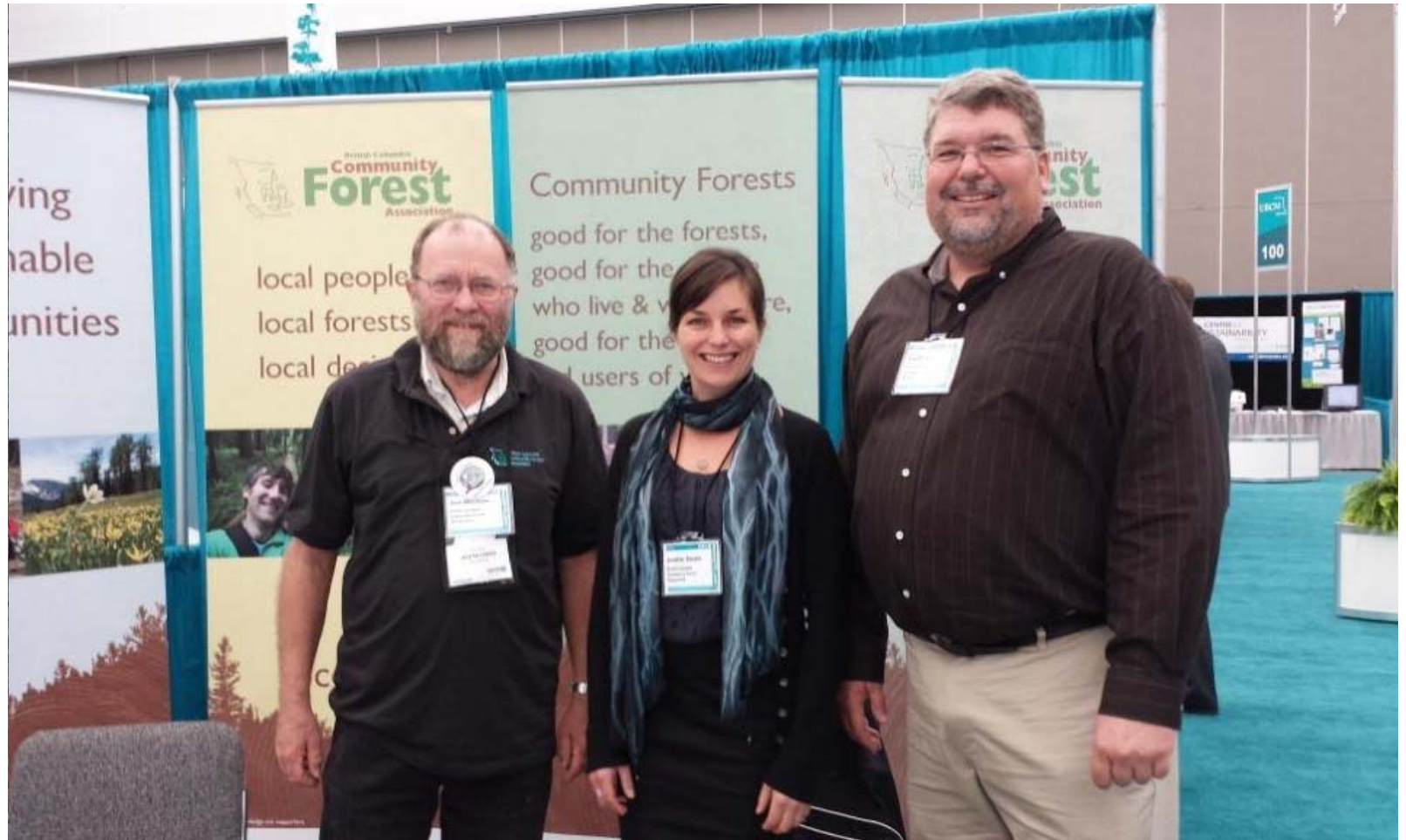
Union of BC Municipalities Convention