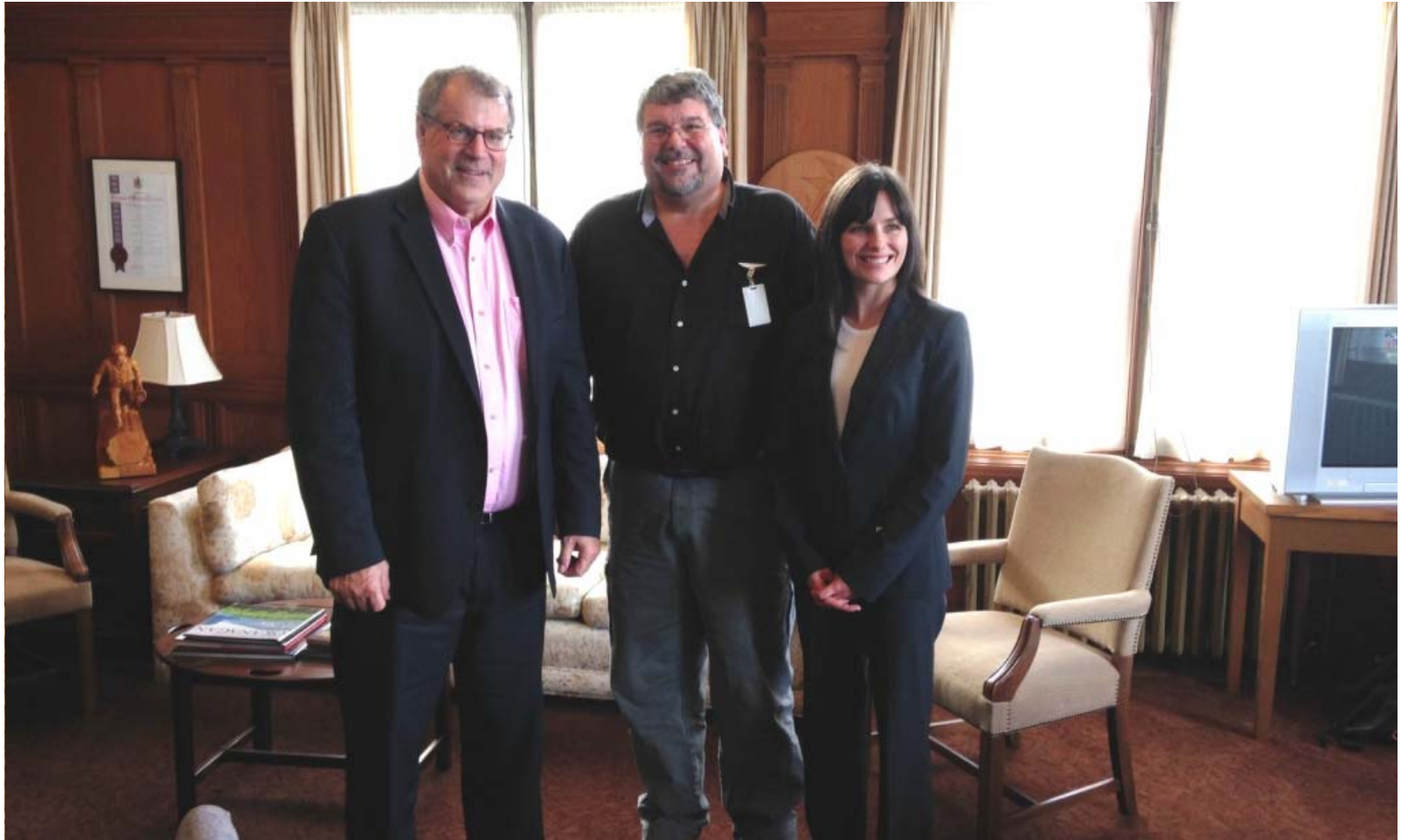
BCCFA with Minister of Forests Lands and Natural Resources Ops – Honourable Steve Thomson