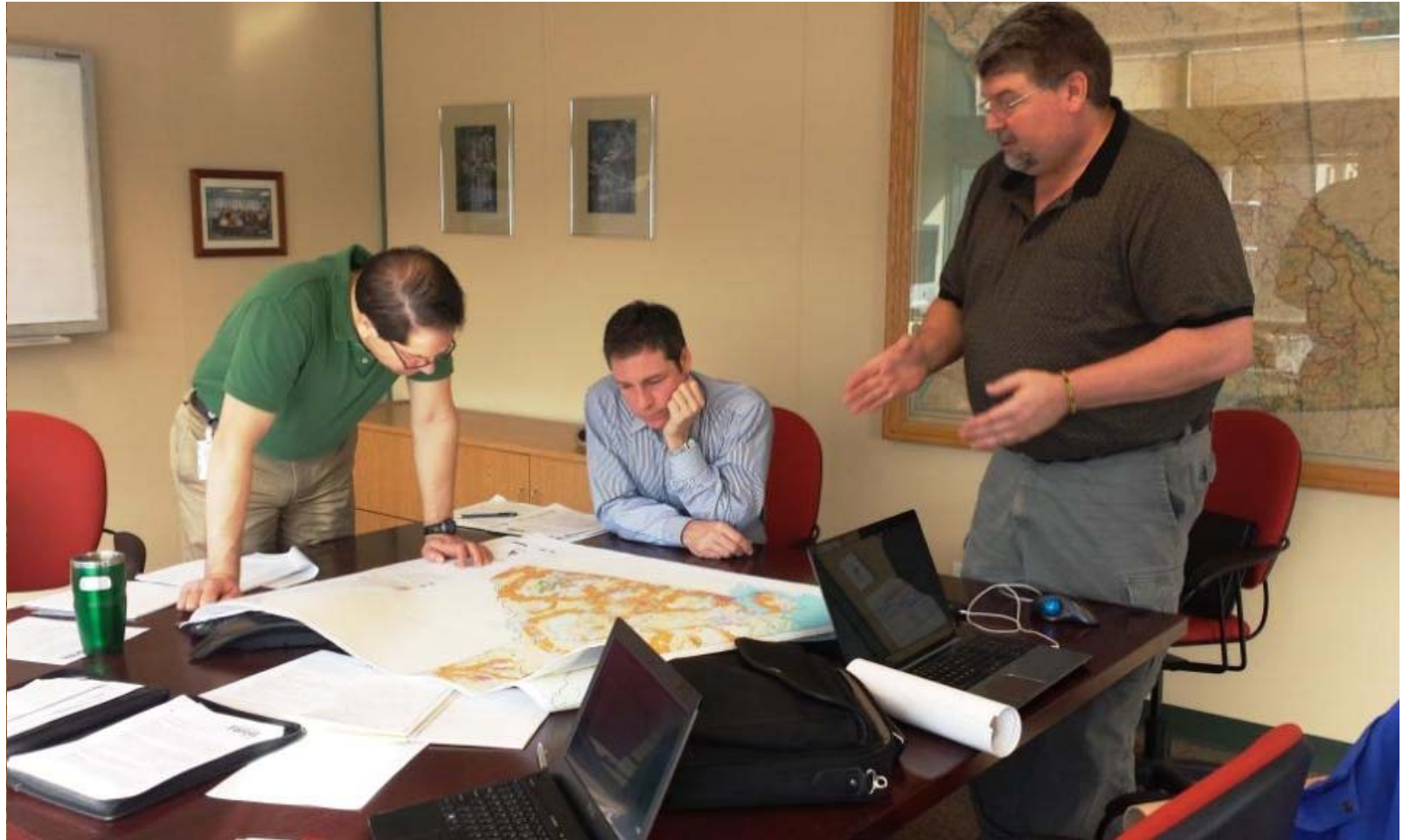
Meetings with Tenures Branch Staff, Victoria BC