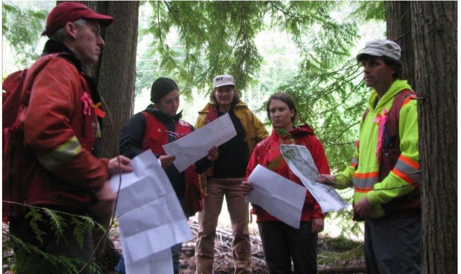
UBC Summer Interns In Nakusp CF